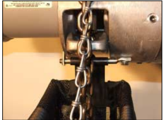
Figure 1. Hinge Pin and Hanger Installation (Pull Cord Model Shown)