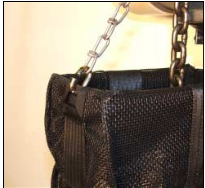
Figure 2. Support Chain Connection at Container